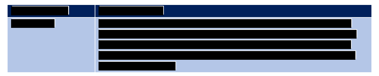
Exhibit 6-7. MetTel Personnel Responsible for Maintaining and Updating B.4 Tables

Exhibit 6-7 shows MetTel's personnel responsible for maintaining and updating B.4 tables.