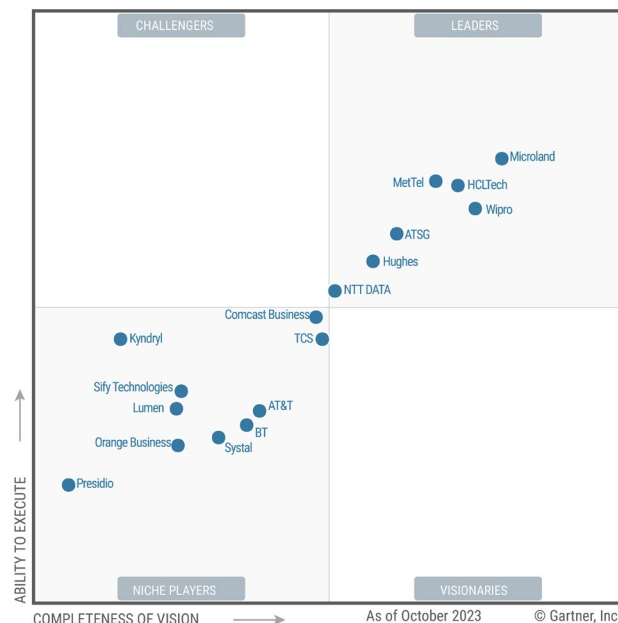
Figure 1: Magic Quadrant for Managed Network Services