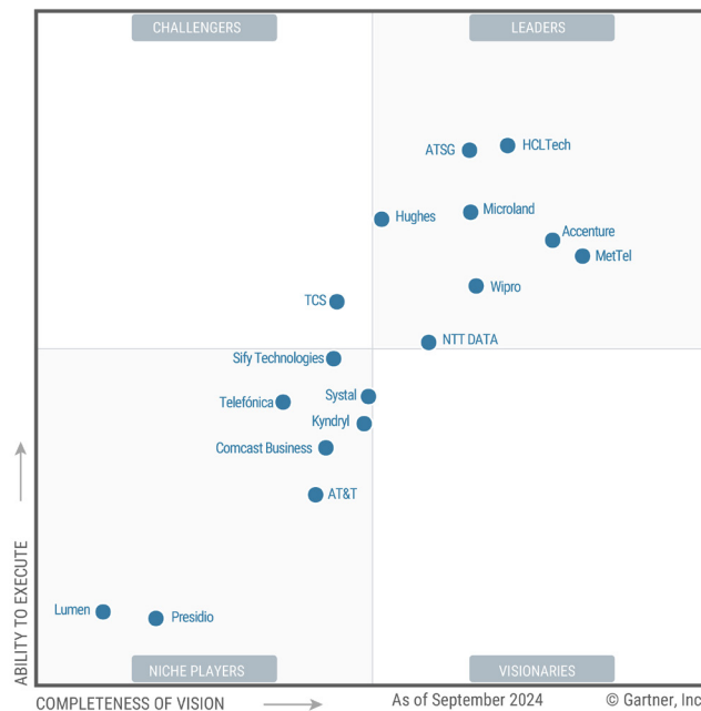
Figure 1: Magic Quadrant for Managed Network Services